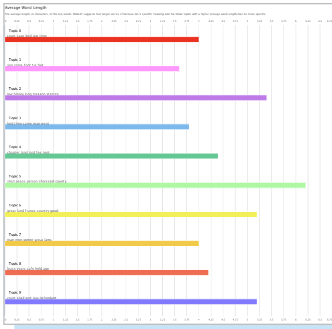
“Chance Medley” content set—topic modeling results.