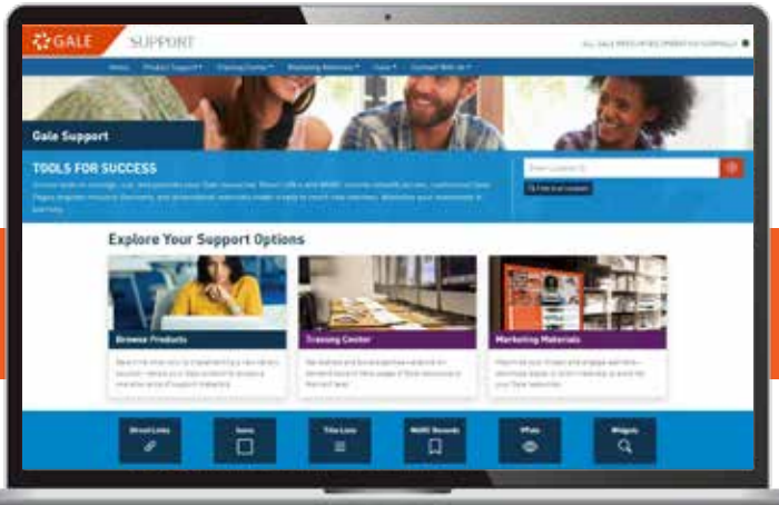
Product screen canture as of June 2023. Actual interface may vary