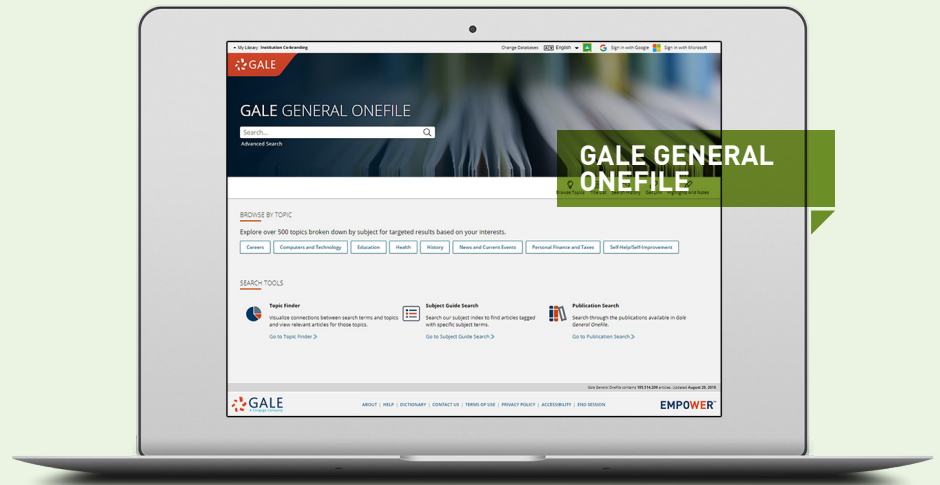
Product screen capture as of August 2019. Actual Interface may vary.