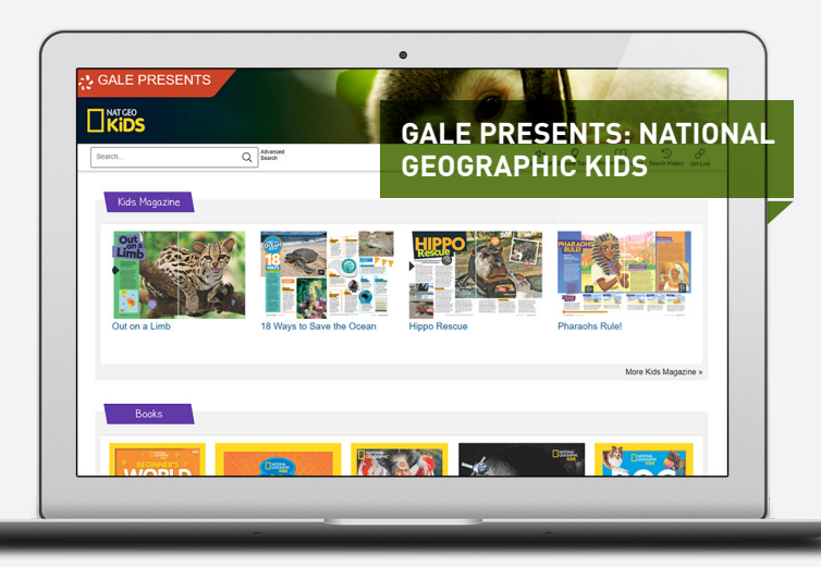
Product screen capture as of October 2022. Actual interface may vary.