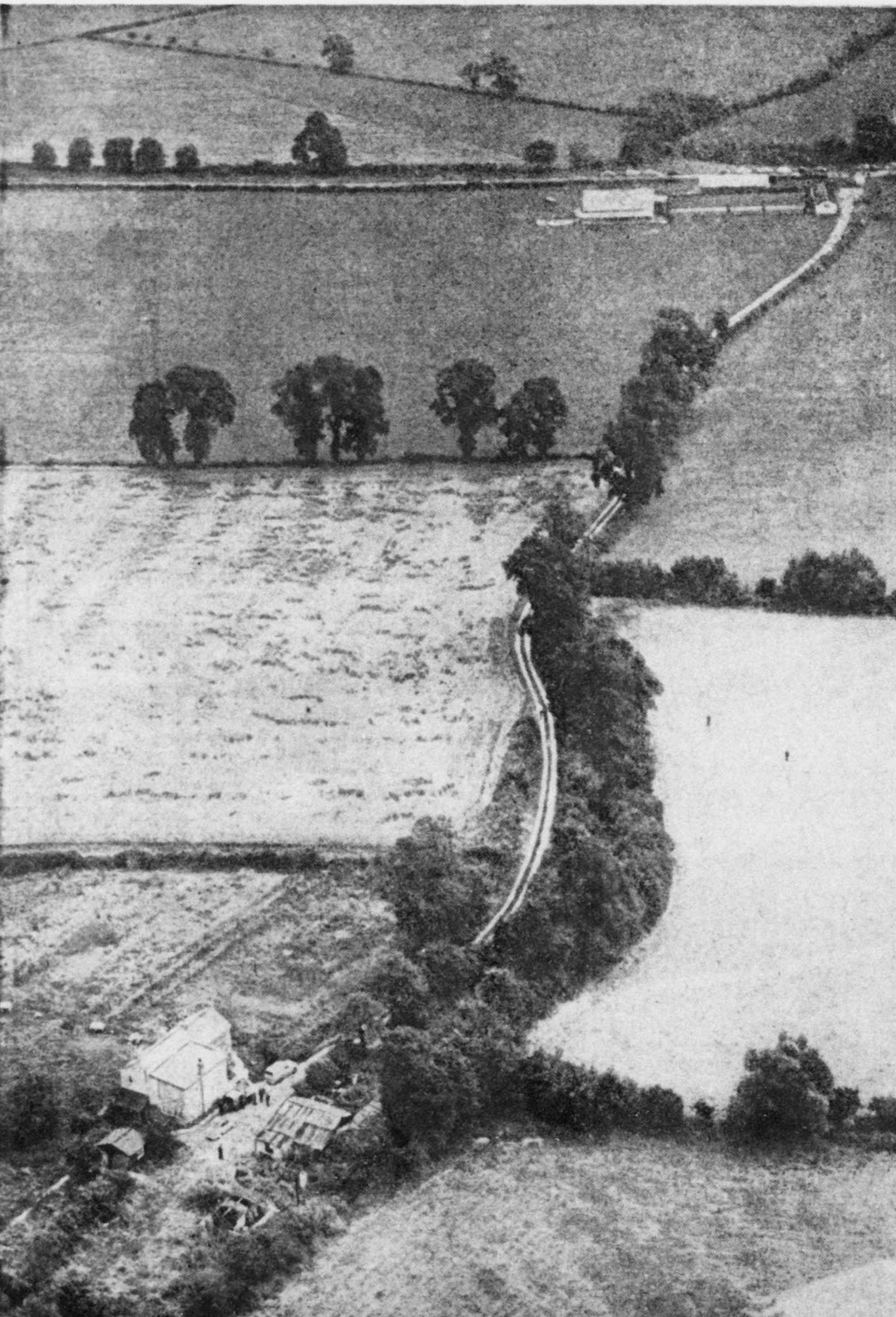
The half-mile long track linking the isolated farm buildings with the B.4011, Thames-Bicester road (background).