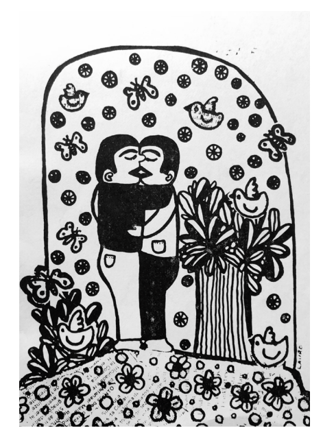
Ephemera from the Canadian Vertical Files at The ArQuives.