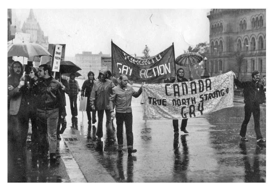
Between 100 and 200 people participated in the Toronto Gay Action protest on August 28, 1971. Jearld Moldenhauer, "Ottawa March Demonstrators," The ArQuives Digital Exhibitions.