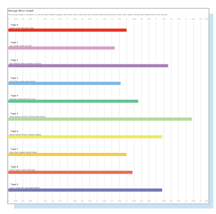
"Chance Medley" content set—topic modeling results.