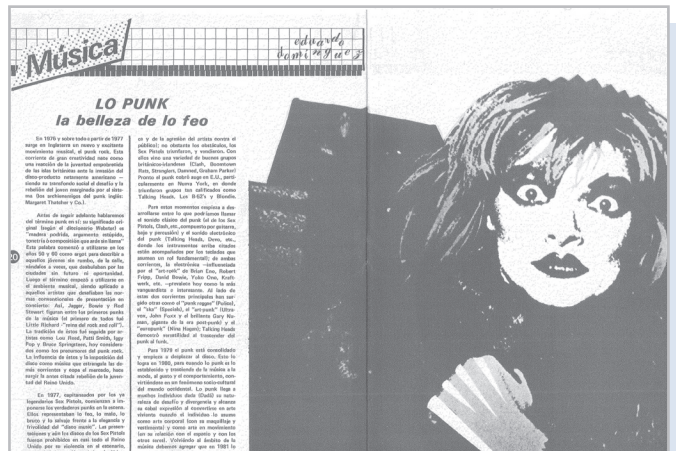
Venezuelan magazine calls Little Richard the queen of rock and roll and rock's first punk, Música , Marzo-Abril 1981, Boletín Informativo del Grupo Entendido , Caracas, Venezuela, Archives of Sexuality and Gender .

"I was greatly impressed by the amount of resources available, the kinds of resources Gale offered, and how easy it is to navigate Gale's databases."