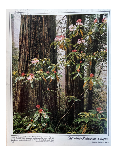
Save-the-Redwoods League Spring Bulletin, 1973, Institute of Governmental Studies Library, University of California, Berkeley.