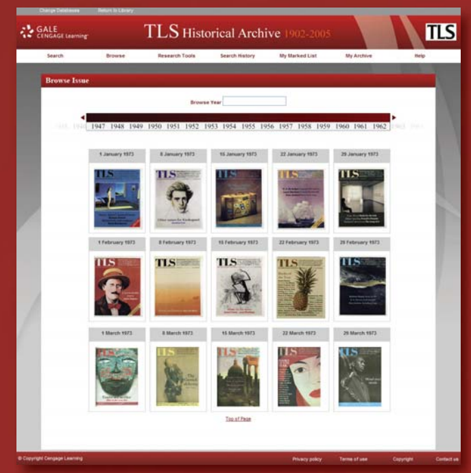
Browse issues page - browse issues by covers over the years

Users can access any page through full-text searching or via the enhanced online version of the published index; by a book's title, author or contributor. Results provide complete bibliographic information, title of work reviewed and author and publisher information.