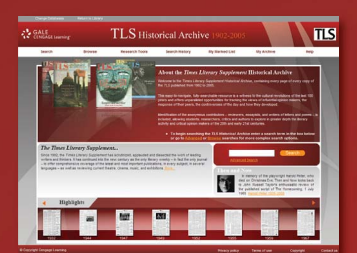
Home page - new interface with multiple search options