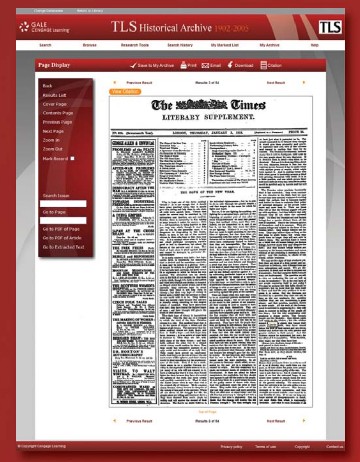
Document view page – print, email or download entries at the article level or save in 'My Archive'