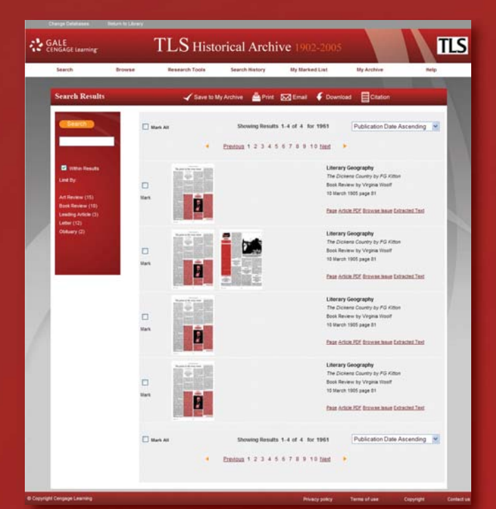
Search results page - preview thumbnail image of articles