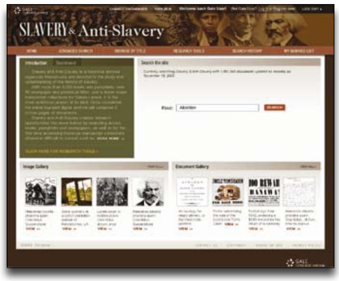
Brings together historical books, legal documents, portraits, maps, manuscripts, pamphlets, newspapers and periodicals for the world's largest archive on the history of slavery