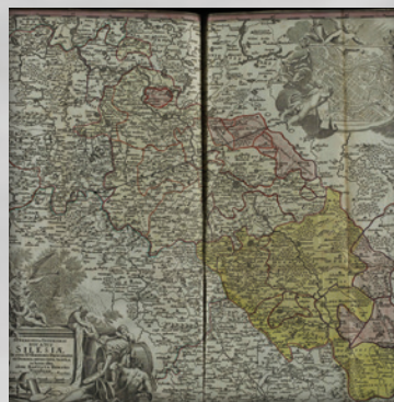
SP 80/233 f. 252 *